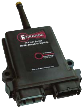
CAN-6 Receiver shown