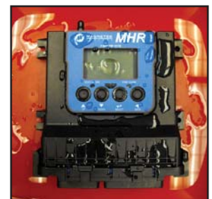
Rugged waterproof design