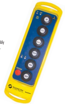
Fits comfortably in your hand.